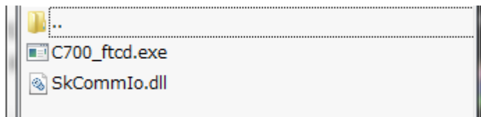
Figure 2. C700_ftcd.exe and SkCommIo.dll in folder