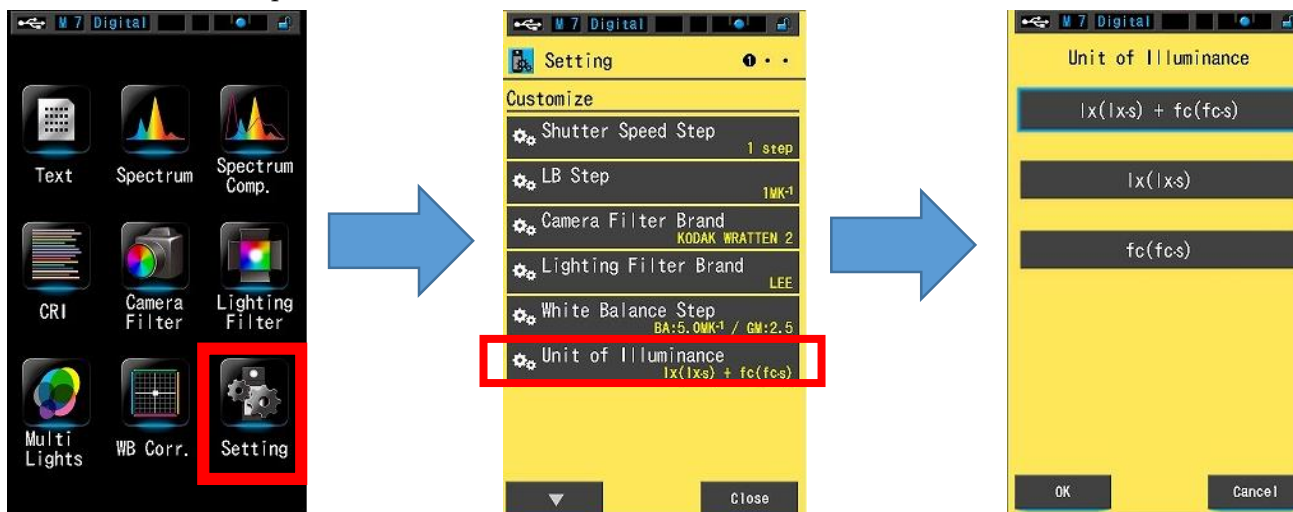
Figure 5. Selecting the Unit of Illuminance

Please read C-700R SpectroMaster Instruction Manual at P.138